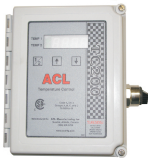
ACL TC 200

The ACL Pilotless Burner Control System provides a simple and easy to use system that provides a safe means of lighting the burner with the added benefit of temperature control and fuel gas savings of a pilotless burner.